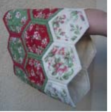
Join the hexagon rows into a circle by joining A to B.