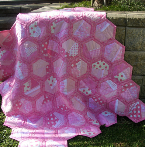
'In the Pink' quilt - measures 1.32m x 1.30m (52" x 51") but you can easily make it larger by adding more hexagons.