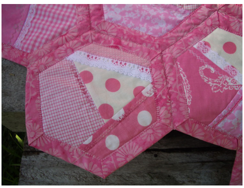
Close up of the 'In the Pink' quilt showing the embellishments and the buttonhole stitching on the edge of the 10" hexagon.

D. Mark with a pencil (lightly) or a chaco liner around the inside edge of the 10" hexagon. Press under on this line. Pin the 8" hexagon into the centre of the 10" hexagon and buttonhole stitch around the edge.