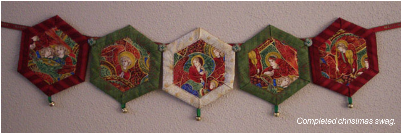
Completed christmas swag.

An easy Christmas swag constructed with 5 x 6" hexagons. I used three background colours and a constant fabric for the 'images' inside the hexagons.