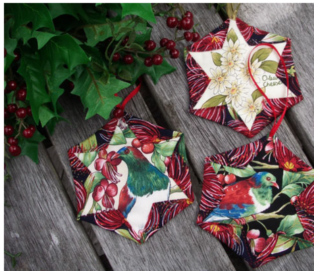
Highlight different fabrics in the centre of the stars. Embellish with beads and ribbon as desired.