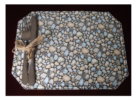
Placemat using the pebbles fabric. Great for the bach.