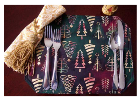
For christmas with a difference try this batik with christmas tree motifs and use the gold holly batik for table napkins.