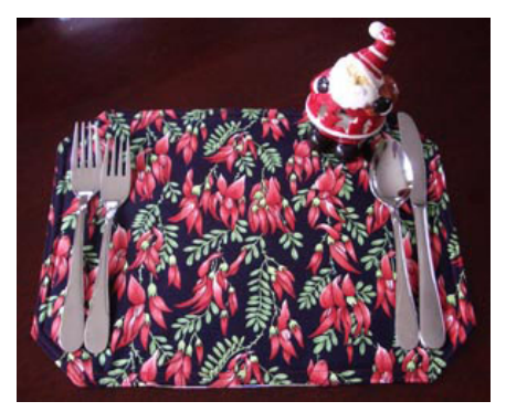
New Zealand kaka beak has a wonderful red blossom with green leaves. Great Christmas colours.

Sewing: With 2 placemats right sides together ,on top of one piece of batting, sew a ¼" seam all round the placemat leaving about a 5" gap at the bottom. Turn the placemat to the right side. Press the seam and slip stitch the opening closed. Top stitch about 2mm away from the edge round the placemat and then stitch another row about ¼" from the first row. Use your presser foot as a guide.