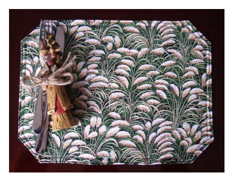
Placemat using the toi toi fabric.