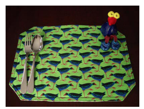
Bright pukeko fabric was used to make this funky placemat.