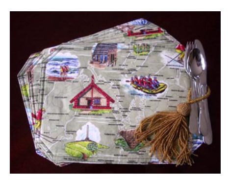
Clean green New Zealand fabric is great for an overseas gift, a map of NZ is in the background with lots of NZ towns and cities and icons.