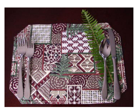
For a traditional NZ placemat try kowhaiwhai or another maori designed fabric.