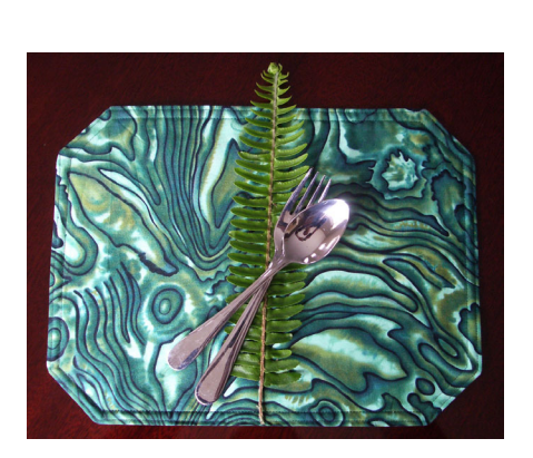
For a Christmas green with a New Zealand touch why not use some of the green paua fabric.