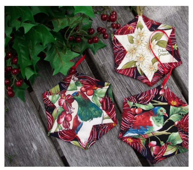
Highlight different fabrics in the centre of the stars. Embellish with beads and ribbon as desired.